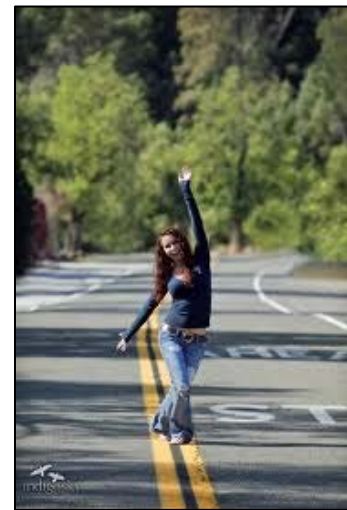
Will NOT Be Accepted As a Senior Portrait