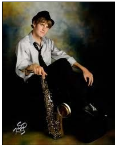
Will be Cropped to Head & Shoulders